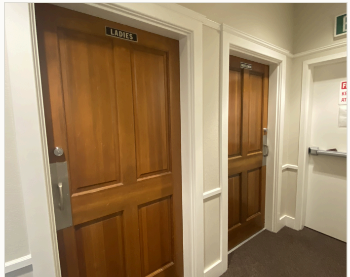
Clockwise from top-left: 697 Higuera Street entrance · a furnished-suite example · shared common restrooms · the building staircase. Prime walkable downtown San Luis Obispo — steps from the County Courthouse, Mission Plaza, dining & shops.